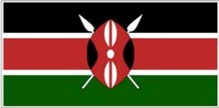
Figure 1: Kenya National Flag

The national flag is a symbol of identity and sovereignty of a country. Except for international conference venues of international conferences, the hoisting of a national flag means that the sovereignty of that nation has been extended over that territory. In the event of war between countries, when a flag is hoisted on a foreign territory it is a sign that this foreign territory has been conquered and submitted to the conquering authority.