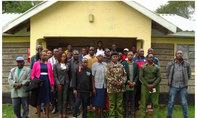
Participants during a Community dialogue in Nakuru County on 23 rd April, 2025.

In a concerted effort to foster peace and social cohesion, NCIC Central Rift office, in collaboration with Peace Cop, hosted a vital community dialogue at the Salgaa Chief's Office on Wednesday, 23rd April 2025. The forum brought together 25 participants, including village elders from the Nyumba Kumi initiative and various peace and security stakeholders, to discuss pressing issues affecting the area.