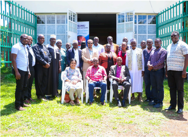
Participants during the PCVE meeting in Kisumu County on 23 rd April, 2025.

The National Cohesion and Integration Commission in partnership with Inter-Religious Council of Kenya (IRCK), hosted a strategic engagement under the Kisumu Interfaith Network in efforts to strengthen resilience in preventing and countering violent extremism (PCVE)