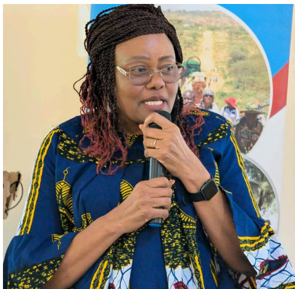
NCIC Commissioner Hon. Dorcas Kedogo during the dialogue meeting on April 25 th 2025, Laikipia County

In the heart of Laikipia County, where the rugged landscapes often echo with stories of tension and rivalry, a powerful dialogue is quietly reshaping the future. On Friday, April 25th, the National Cohesion and Integration Commission (NCIC), in collaboration with the Indigenous Movement for Peace, Advancement and Conflict Transformation (IMPACT), brought together the Samburu and Turkana communities in Rumuruti for a groundbreaking peace dialogue.