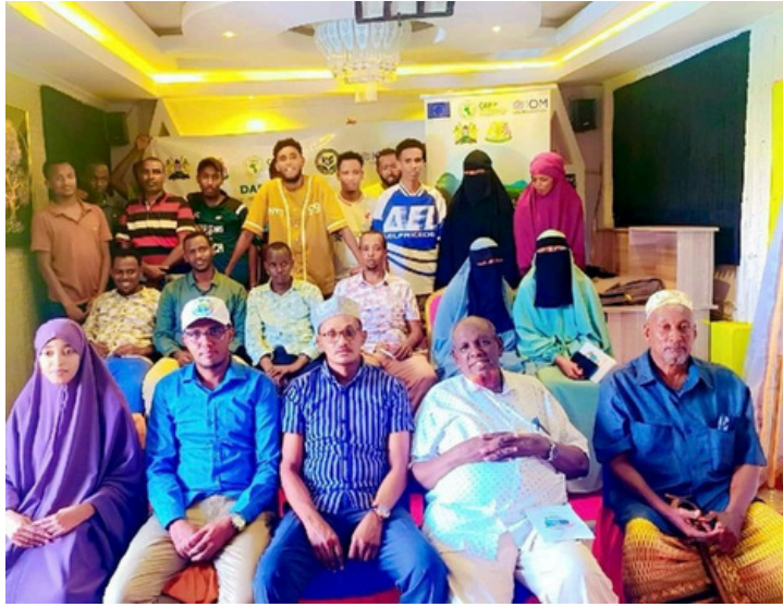
Participants during the sensitization forum, in Rhamu town, Mandera County on 23 rd April, 2025.

The National Cohesion and Integration Commission, on Wednesday, 23rd April 2025, in collaboration with the Intergovernmental Authority on Development (IGAD), convened a youth sensitization forum in Rhamu town, Mandera County. The event convened from the youth from the region. The forum's aimed to to raise awareness on the growing threats posed by hate speech and irresponsible use of social media platforms.