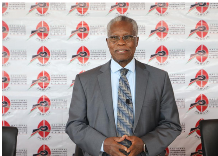
NCIC Chairperson, Rev. Dr. Samuel Kobia, CBS, giving his remarks during the Amani clubs essay writing and awards ceremony on 20 th May, 2025 at the NCIC HQ in Nairobi.