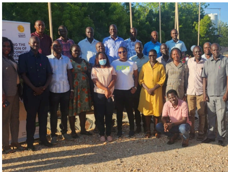
Participants during the dialogue meeting on April 25 th 2025, Laikipia County

The dialogue went beyond cultural reflection, spotlighting the growing challenge posed by social media misuse. Youth, often caught between modern technology and traditional expectations, were highlighted as both vulnerable to manipulation and crucial players in the peace process.